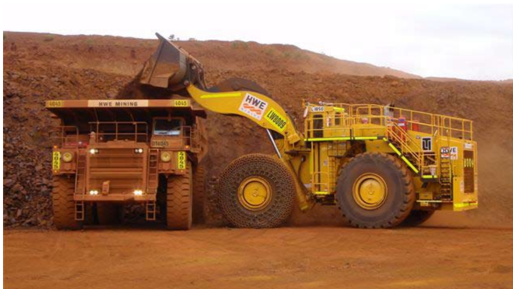
Left // The new fuel efficient Wheel Loader.

In the short term, new loader will deliver annual energy savings of 5,420 GJ. In the long term, annual energy savings could be as high as 42,480 GJ or 2,960 t CO 2 e-.